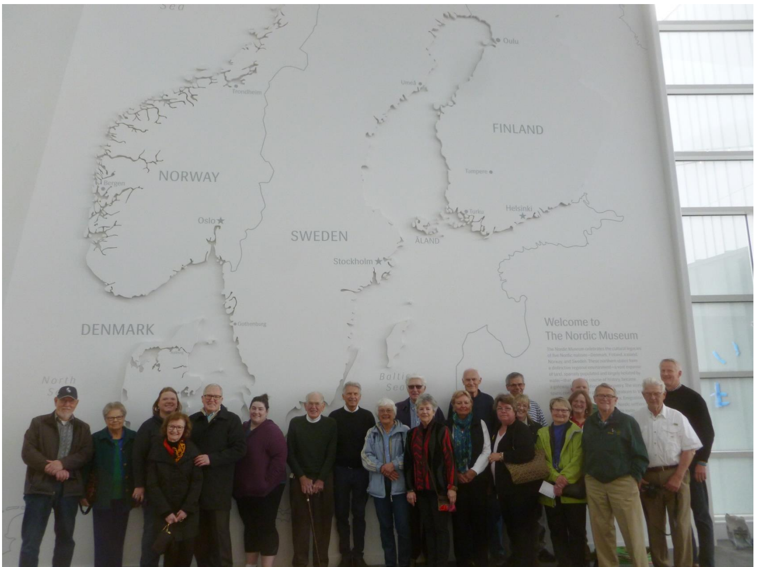
A group of Lodge 29 members & friends enjoyed a Pre Opening Visit to the New Nordic Museum in Ballard –Looking forward to the Grand Opening celebrations starting May 5 th .